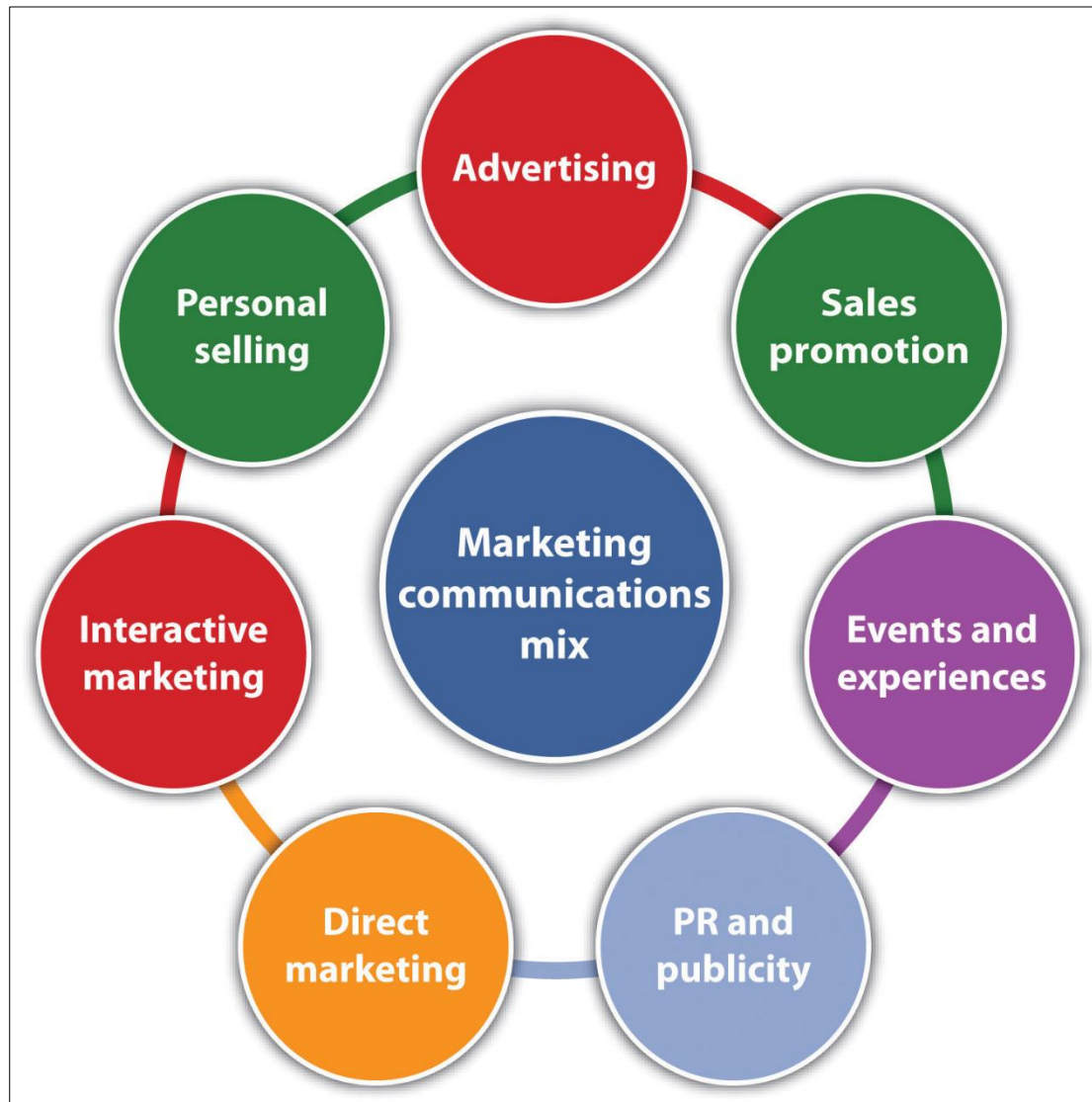
Figure 2. Promotional marketing strategies.